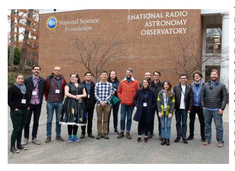
The 2020 Cycle 8 ALMA Ambassadors from the NAASC

The ALMA Ambassadors Postdoctoral Program provides training (and up to a $10,000 research grant if based in the U.S.) postdoctoral researchers interested in expanding their ALMA/interferometry expertise sharing that knowledge with their home institutions through the organization of ALMA proposal writing workshops. Each year beginning in Cycle 5, the NAASC sponsors a group of selected postdocs to travel to Charlottesville, Virginia to receive in-depth training in topics related to ALMA proposal writing (including interferometry basics, ALMA science capabilities, recent ALMA headlines, and use of the Observing Tool) as well as guidance with speaking on these topics.