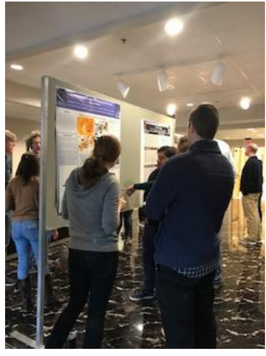
ALMA Ambassadors and NAASC Staff at the poster reception during the Ambassador training session – 2019 February