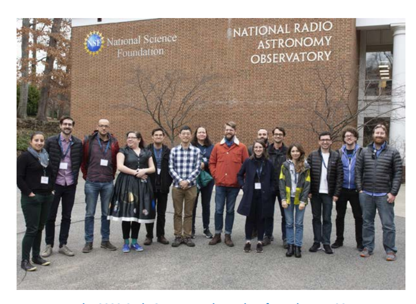
The 2020 Cycle 8 ALMA Ambassadors from the NAASC

The ALMA Ambassadors Postdoctoral Program provides training (and up to a $10,000 research grant if based in the U.S.) to postdoctoral researchers interested in expanding their ALMA/interferometry expertise and sharing that knowledge with their home institutions through the organization of ALMA proposal writing workshops. Each year beginning in Cycle 5, the NAASC sponsors a group of selected postdocs to travel to Charlottesville, Virginia to receive in-depth training in topics related to ALMA proposal writing (including interferometry basics, ALMA science capabilities, recent ALMA headlines, and use of the Observing Tool) as well as guidance with speaking on these topics.