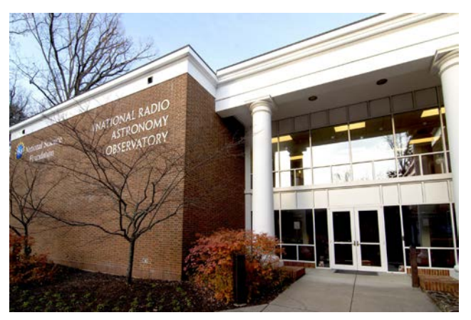
Stone Hall on the Campus of the University of Virginia and headquarters of the North American ALMA Science Center.

The NAASC is located in part at NRAO Headquarters, on the Grounds of the University of Virginia (UVa), and a short walk from the UVa Department of Astronomy (Section 12). The NRAO and UVa Astronomy share colloquia, journal clubs, science group meetings and lunch talks. Several NAASC staff have joint or adjunct appointments at UVa. The NAASC is also located in part at NRC Herzberg Astronomy & Astrophysics, located in Victoria, BC, Canada. A listing of NAASC staff, including research interests, is available here: http://science.nrao.edu/facilities/alma/ALMApeople/